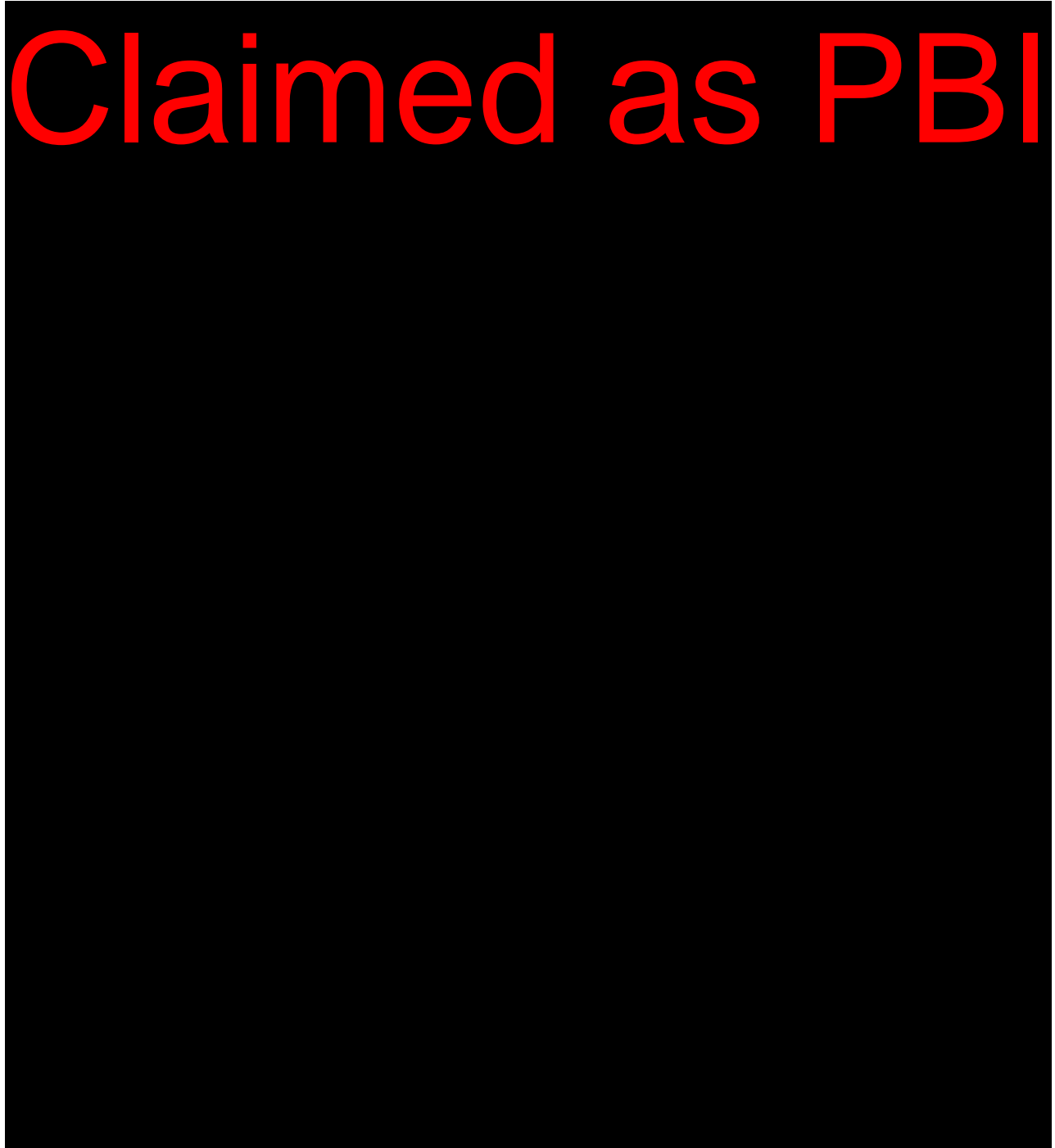
Table PISC- 4 Monitoring Plan for post-injection site care.

Table PISC- 4 describes the methods and techniques to be used while monitoring the site during the post-injection period. Locations and frequency for each method or technique are also presented in Table PISC- 4.